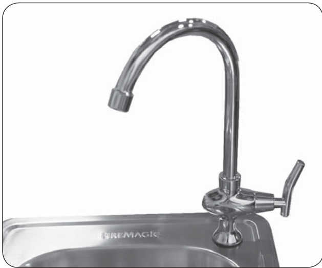
Faucet shown here with Fire Magic® sink (not included but available separately)